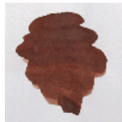
Saddle Brown C