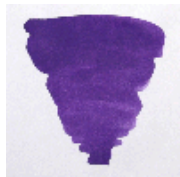
Imperial Purple C