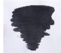
Jet Black C