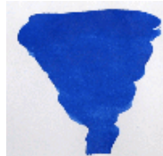
Sapphire Blue C