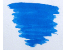
Royal Blue C